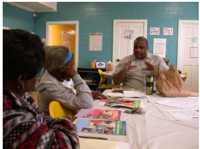
Parkway Place Neighborhood Institute Spring 2009