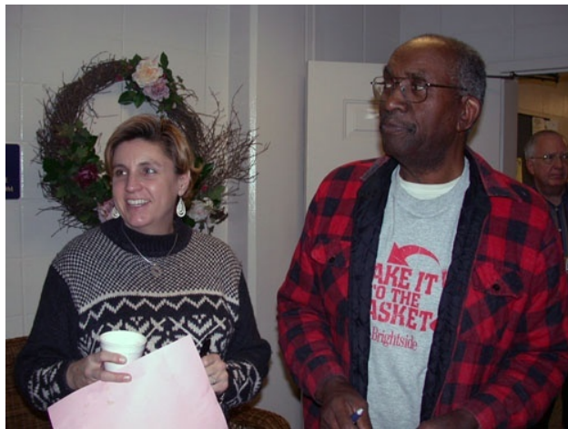
Networking at the November brunch.