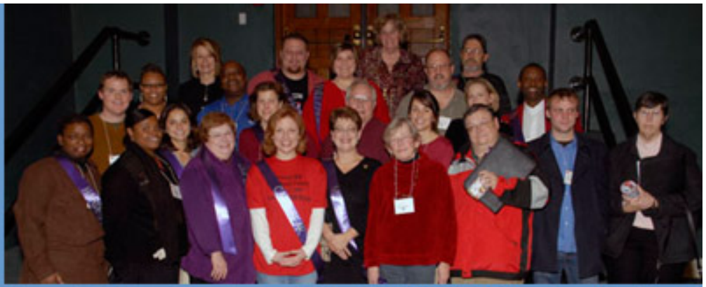
Congratulations, Graduates of the Fall 2007 Neighborhood Institute!